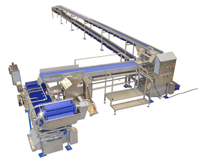
The line for apple processing combines existing machines from different manufacturers with new machines and conveyor belts